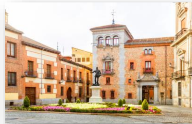
Plaza de la Villa