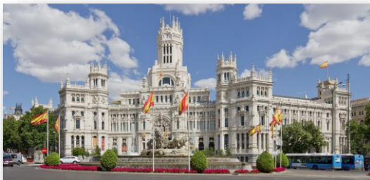
Plaza de Cibeles

If interested, tick the box in the on-line registration page .